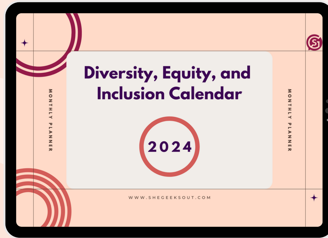
2024 DEI CALENDAR